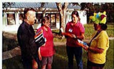
AT&T presents HSELC with cell phones and pre-paid phone cards for teachers and staff.