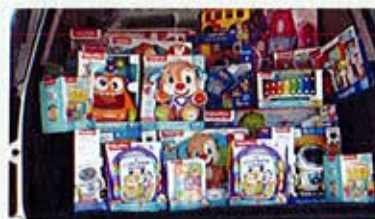
Mattel presents a trunk full of educational toys to enhance the children’s developmental skills.