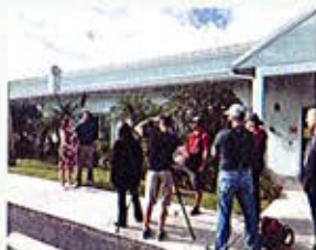
Designing Spaces video production crew shooting a segment at HSELC.

The Hobe Sound Early Learning Center was chosen from a nationwide search to be the featured Early Learning Center for this special program. The episode emphasized the importance of early childhood education and “play” during the formative years of a child’s life. The episode aired on December 14 th and 21 st , 2017. You can view the segment at https://www.youtube.com/watch?v=hTHGXv8BNSA . Mattel and AT&T were partners in this program.