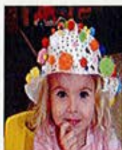
Easter Bonnet Parade